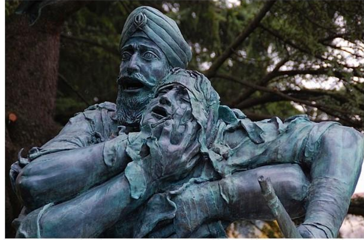
Forli Indian cemetery of second world war soldiers, Italy - S. Deepak, 2011