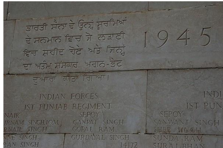
Forli Indian cemetery of second world war soldiers, Italy - S. Deepak, 2011