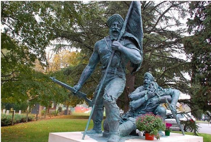
Forli Indian cemetery of second world war soldiers, Italy - S. Deepak, 2011

City of Forli is on Via Emilia, the ancient Roman road that connected Rome to Piacenza. The images on this page are from two cemeteries of Forli. The Indian cemetery includes Hindu, Sikh and Muslim soldiers from British India, who had died in Italy during the second world war. Between September 1944 till May 1945, around 50,000 soldiers had come to Italy from British India, out of which 23,000 had been wounded and 11% (around 5,800) had died. Though called "Indian" cemetery, it also has graves of soldiers who had come from cities that are today in Bangladesh and Pakistan. Italian Sikhs have built a memorial to remember Sikh soldiers who had died here and in August Sikhs gather every year for a day of remembrance and pride.