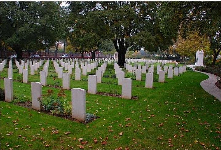
Forli Indian cemetery of second world war soldiers, Italy - S. Deepak, 2011

City of Forli is on Via Emilia, the ancient Roman road that connected Rome to Piacenza. The images on this page are from two cemeteries of Forli. The Indian cemetery includes Hindu, Sikh and Muslim soldiers from British India, who had died in Italy during the second world war. Between September 1944 till May 1945, around 50,000 soldiers had come to Italy from British India, out of which 23,000 had been wounded and 11% (around 5,800) had died. Though called "Indian" cemetery, it also has graves of soldiers who had come from cities that are today in Bangladesh and Pakistan. Italian Sikhs have built a memorial to remember Sikh soldiers who had died here and in August Sikhs gather every year for a day of remembrance and pride.